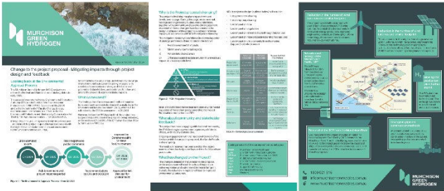
One of our most recent Fact Sheets outlining changes to the Project design

Click here to find our Informational Resources