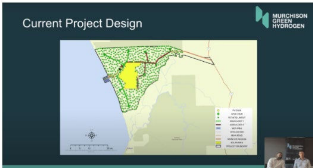
Top: Shohan Seneviratne, CEO, presenting at the first community webinar information session in July 2024