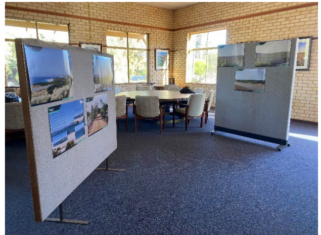
Kalbarri community drop-in session in March 2024